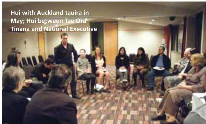
Hui with Auckland taura in May; Hui between Tae Ora Tinana and National Executive